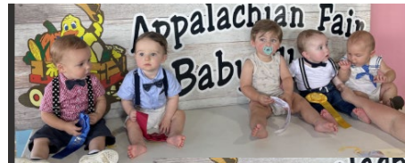
2023 / 6-12 Month Old Boys / Best Developed & Most Handsome