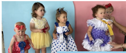
2023 / 13-24 Month Old Girls / Best Developed & Prettiest