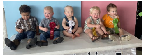
2023 / 13-24 Month Old Boys / Best Developed & Most Handsome