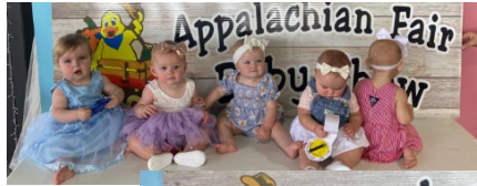
2023 / 6-12 Month Old Girls / Best Developed & Prettiest