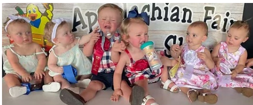
2022 / 6-24 Month Old Twins