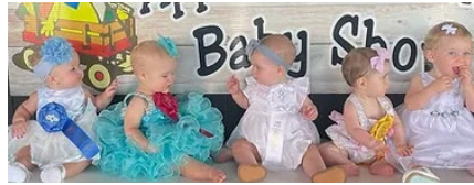
2022 / 6-12 Month Old Girls / Best Developed & Prettiest