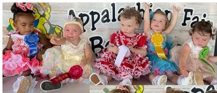
2022 / 13-24 Month Old Girls / Best Developed & Prettiest