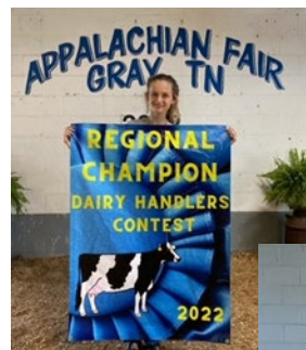
2022 East TN FFA Dairy Handlers Contest Winner