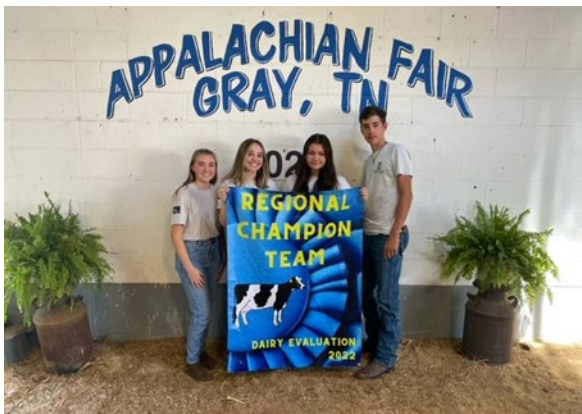
Evaluation Team Winner