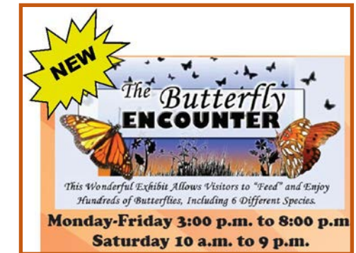
Exhibit Buildings open at 3:00 pm Mon.–Fri. Saturday 10:00 am

Pick up your Hardee's a 1/3 lb Thick Burger coupon with your gate admission